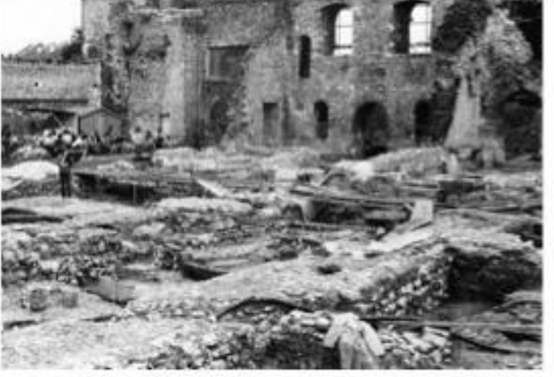
Excavations at Cathedral Green, 1967 (left) and Wolvesey Palace, 1966 (right)

Our decade-long programme of excavation revolutionised key aspects of modern urban archaeology as well as our understanding of Winchester's past. Come along to our exhibition at the Hampshire Record Office to see a variety of finds and other items in a visual sketch of key sites excavated by us in Winchester.