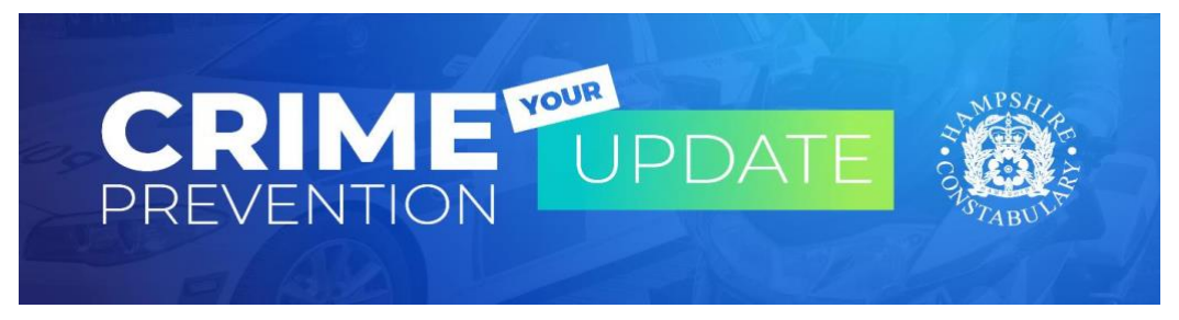
Update from the Force Crime Prevention Team