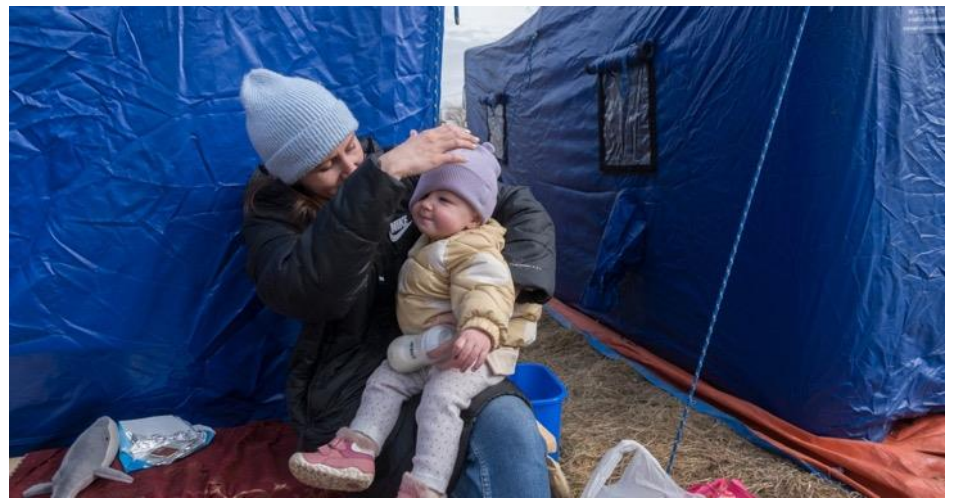
For those wishing to donate items to the collection for Ukrainian refugees in Poland being coordinated by the Southampton Polish Club, there will be a local collection point in the Hursley Parish Hall on Saturday 5th March between 10 and 12.