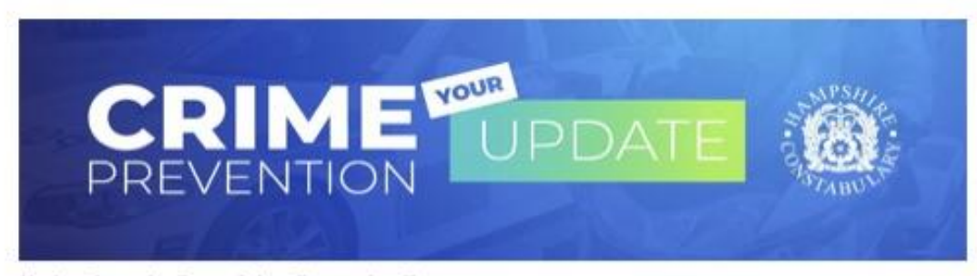
Update from the Force Crime Prevention Team