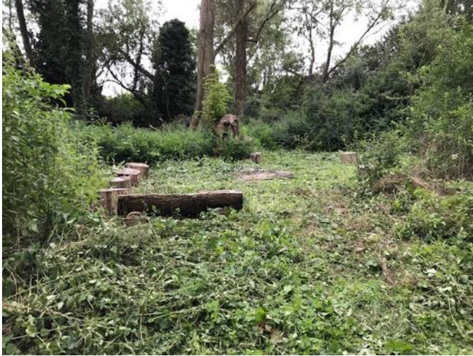
The Picnic Area – upper footpath

The August Work Day was well supported and a lot was achieved during the morning, including clearance of the large open area behind Ham Green Cottage. This area now contains an array of tree-stump stools and a log bench, where people can sit and picnic, or just enjoy the peace and quiet of “the nature”.