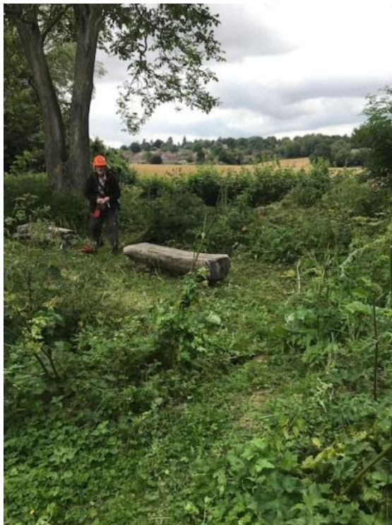
The Glade – lower footpath

Co-incidentally, a party of ramblers came through HG soon after the Work Day, and were delighted to have The Picnic Area to sit in and enjoy their lunch!!