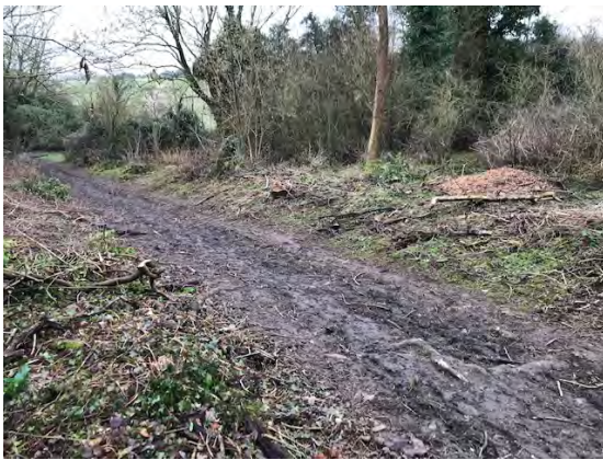
February 2021 – looking downhill

To show just how quickly nature “reclaims its own”, just have a look at these 2 photos of the upper section of the footpath, where the Ash dieback Phase 1 felling took place: