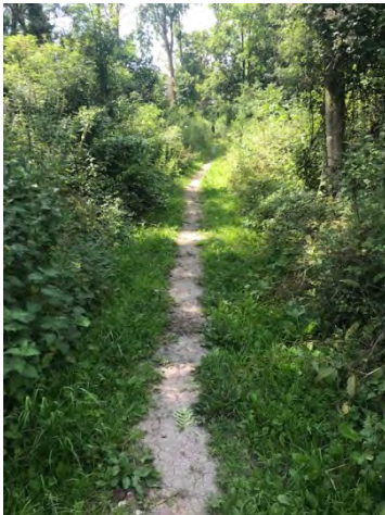
July 2021 – looking uphill