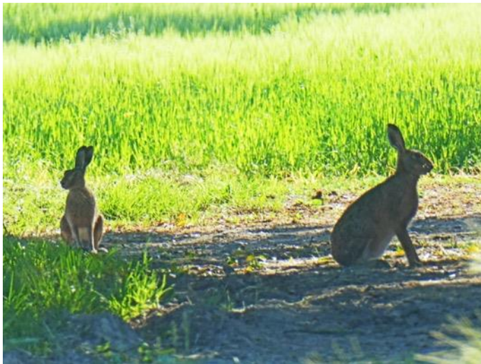
A pair of hares