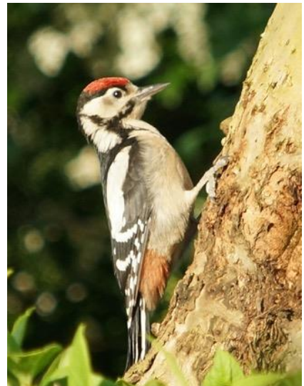
Juvenile Great Spotted Woodpecker