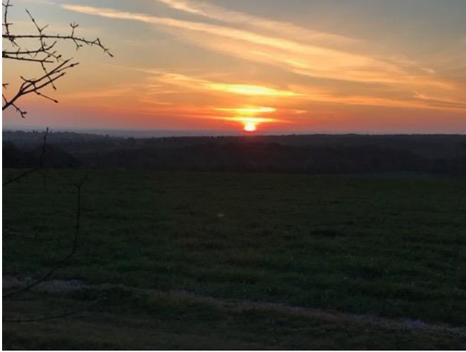
The sunrise taken from Farley Mount on 24 th April 2021

You will need to be up early to see it for real as: