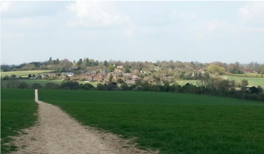
View across to Sparsholt from Crab Wood

“That’s Sparsholt,” mused dad. “Charming example of a rural Hampshire village.”