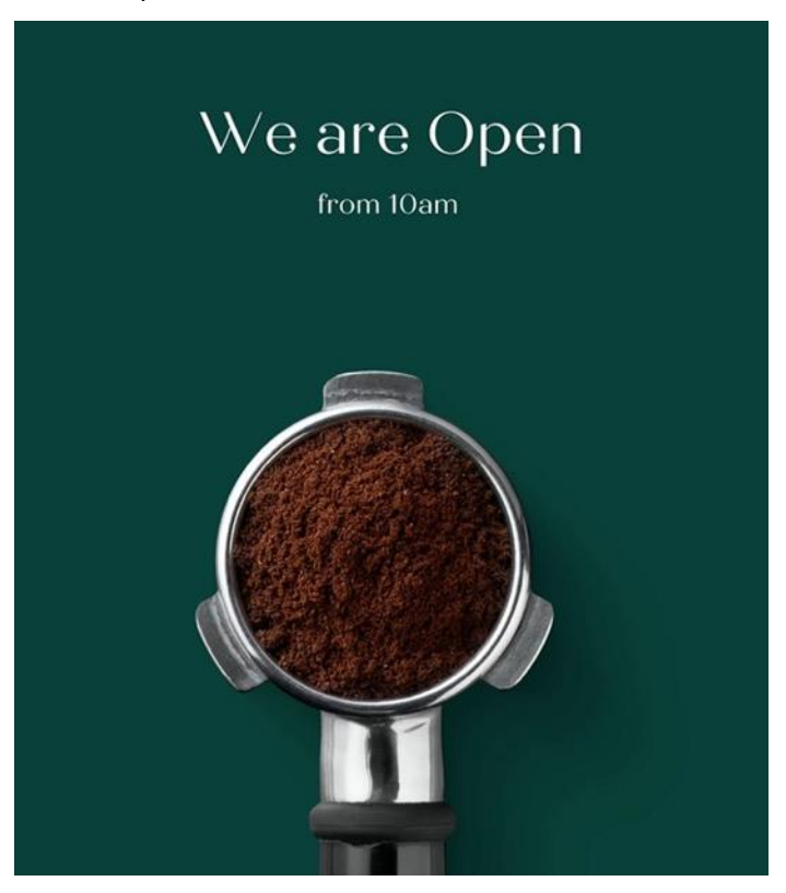
Open Monday to Sunday every day from April 1st

The Plough is open at 10am for coffee and brunch Wednesday to Saturday