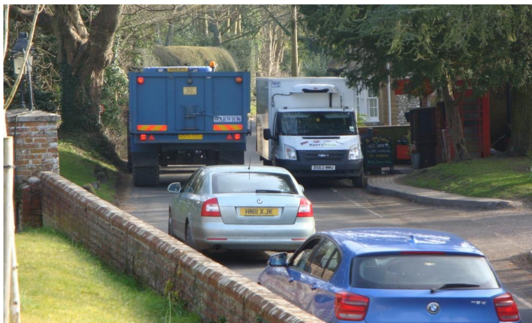
Village Centre & School Entrance

A very strong majority (74.8%) considered vehicles are driven too fast through the Parish, whilst 75.6% believe there is too much through traffic especially during the morning and evening peak times. The village has become a very busy “rat run” at certain times. These vehicles in particular show a lack of courtesy to pedestrians and other road users, with their “me first” attitude and speed.